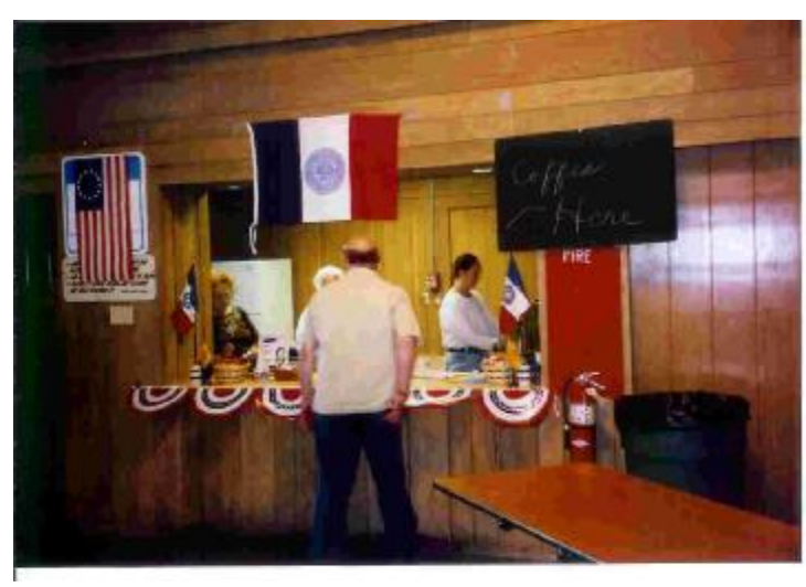
Friday Night at Civil War Days 2006

Friday day the event coordinators: the 30th Indiana Reenactors set up stations for thousands of school kids to tour the grounds and learn about the Civil War time period. That evening the Daughters