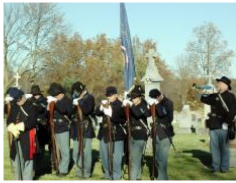
30th Indiana honors while bugler plays