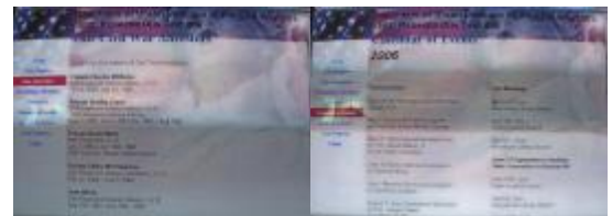
Our Civil War Ancestors page (L) and the Calendar of Events page (R)