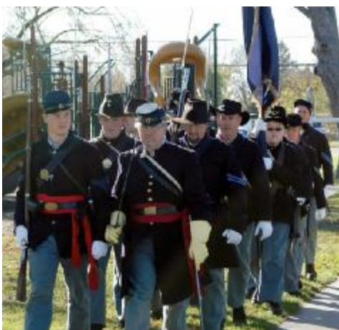
30th Indiana march in and present the colors.