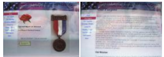
Website Home page (L) and Our Purpose page (R)

Be sure to type in all the letters between the <<>>