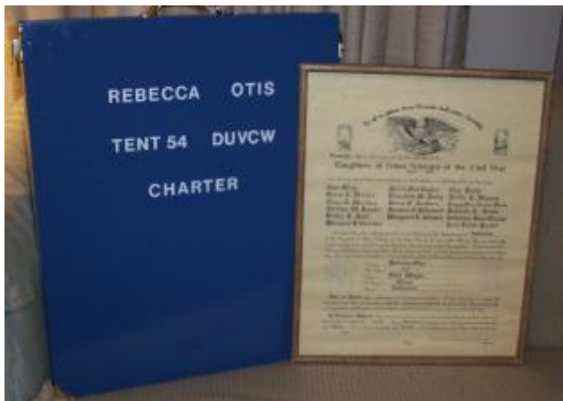
Charter's New Blue Case and the Tent's Charter (right)

Several Indiana Sisters plan to attend Convention. Don't be left out of the Fun!